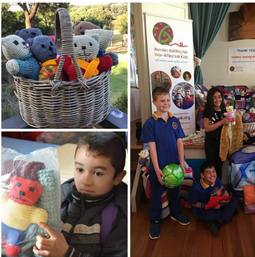
Aussies Knitting for War-Affected Kids